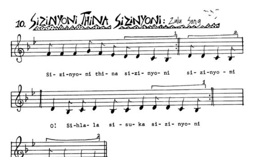
si - zi- nyo- ni

Sizinyoni thina sizinyoni x2 O! Sihlala sisuka sizinyoni x2